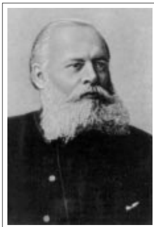
V. V. Markovnikov (1838-1904)

talist, as his record plainly shows. As a student under Kolbe at Marburg, he had completed the first synthesis and characterization of a sulfoxide (15). He also accomplished the first synthesis of a sulfonium salt (16) and worked in Wurtz' laboratory on problems in carboxylic acid chemistry. Both Zaitsev and