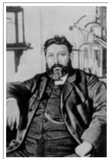
E. E. Vagner (1849-1903)

This new, general synthesis of tertiary alcohols was later extended by Zaitsev and his students to reactions between organozinc reagents and a variety of compounds. The co-author on many of these early works was another of the brilliant organic chemists to come from the Kazan' school: Egor Egorevich Vagner (1849-1903), who later became Professor of Chemistry at the University of Warsaw. Better known in the west as Georg Wagner, the terpene chemist, Vagner had entered Kazan' as a student in law, where he came under the influence of Zaitsev as his mentor had come under the influence of Butlerov when he himself had entered as a student in economic science. By the time Vagner was a student, the two-year chemistry requirement of graduates in the kameral division was no longer in force. However, like his own mentor, Zaitsev had an excellent reputation among his students, and it is not unreasonable to speculate that kameral students at Kazan' may well have passed along to incoming students their opinion that Zaitsev's lectures were worth attending. (Even today, it