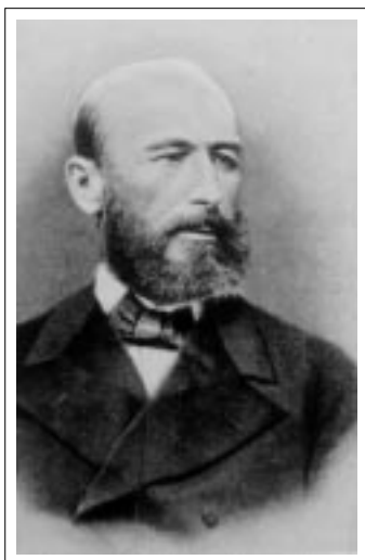
A. M. Butlerov (1828-1886)